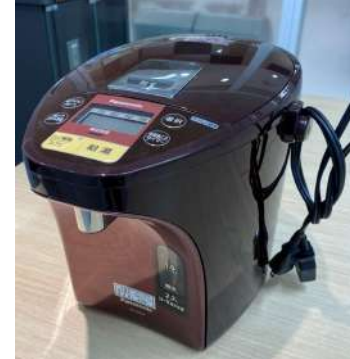
Electric Pod NC-SU224