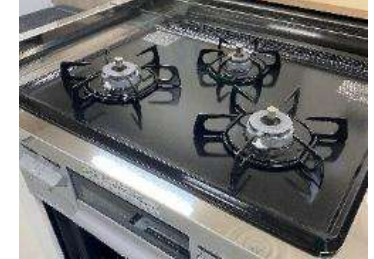
Gas stove DG32T1V/5台