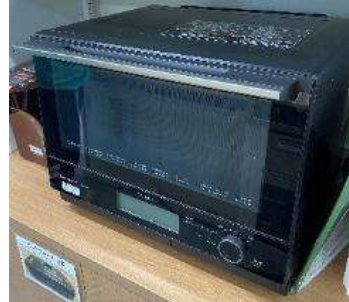
Oven Range NE-BS808