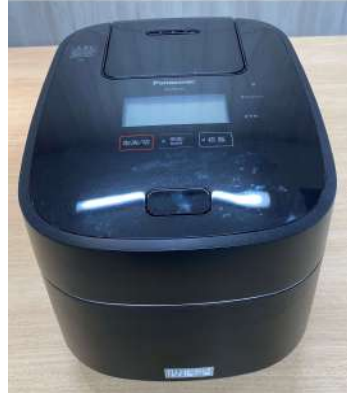
rice cooker SR-VSX181/2台