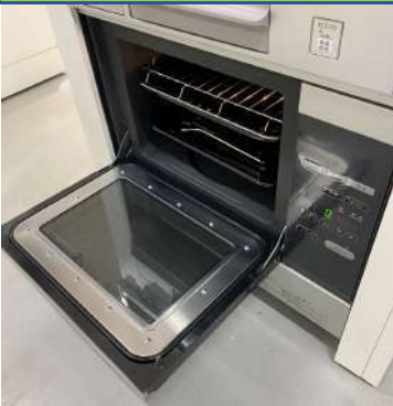
Gas High Speed Oven DR-320/5台