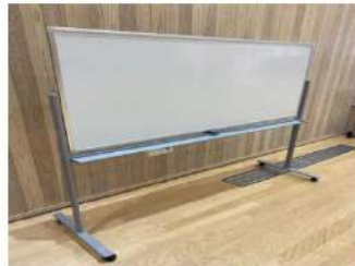
4 units/Whole W180xH190 Entry section W180xH90