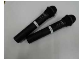
2 units/Panasonic WX-ST200