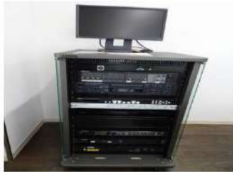
1 unit/playback medium (Blu-ray /DVD/CD/SD/USB)