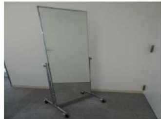
3 units/mirror surface W45x155