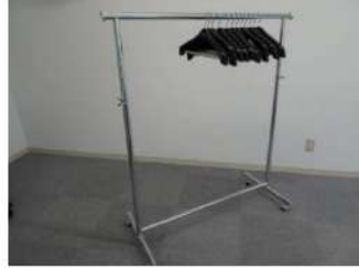
3 units/1 hanger rack 10 hangers