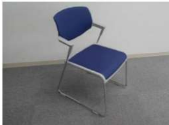
42 chairs in total 28 chairs (1 training room already placed) 14 chairs remaining (in the warehouse)