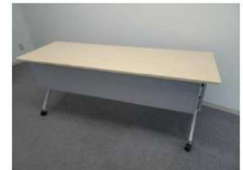
14 legs/with curtain plate W180xD60xH70