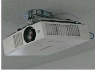
1 unit/Panasonic PT-VMZ60/6.000ml