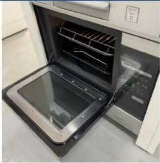
gas fast oven DR-320