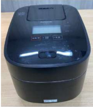
rice cooker SR-VSX181