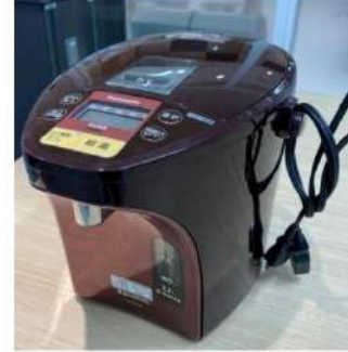
electric pod NC-SU224