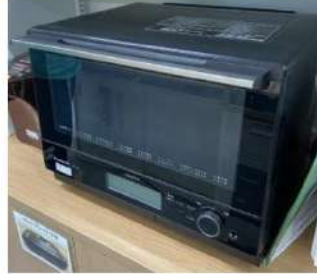
oven range NE-BS808